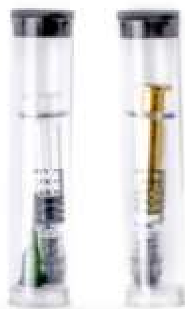
Plastic Packaging Tube