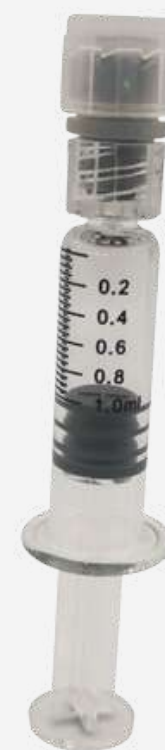
CHILDPROOF GLASS SYRINGE