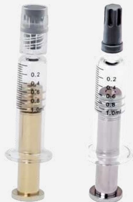
GLASS SYRINGE W/ METAL PLUNGER