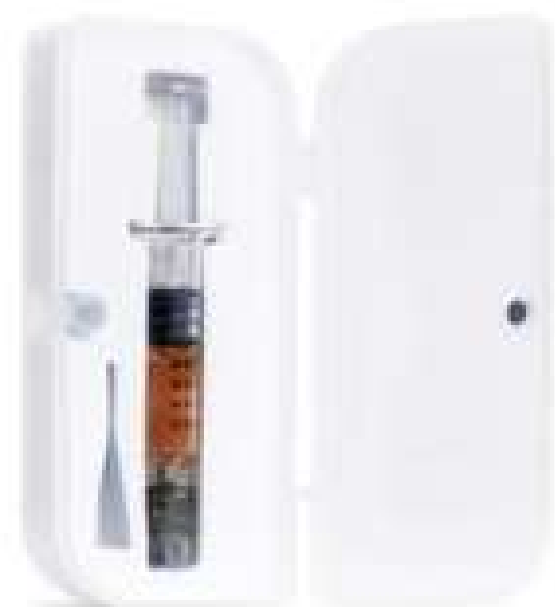
Magnetic Packaging Box