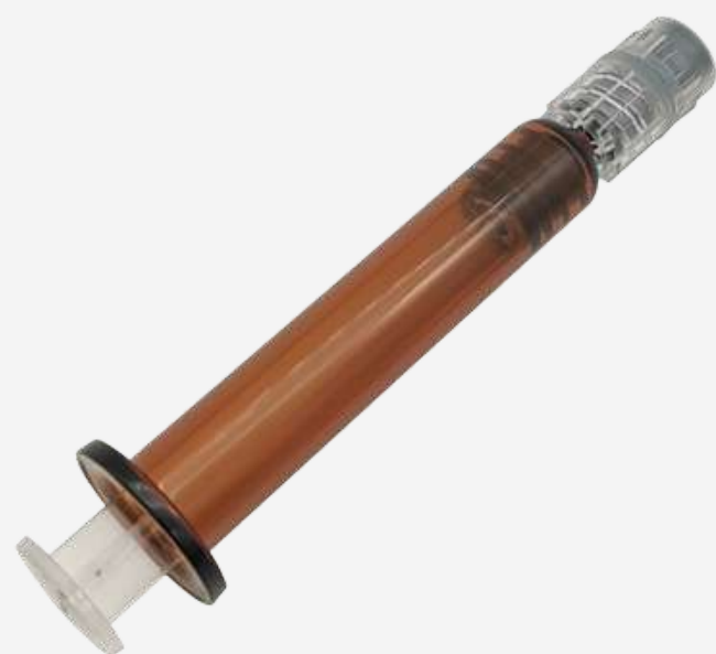
AMBER GLASS SYRINGE