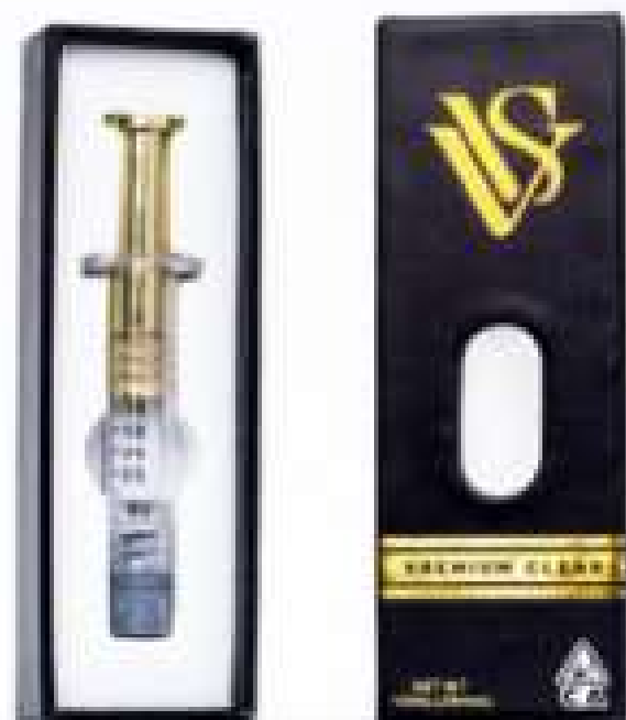
CR Rigid Packaging Box