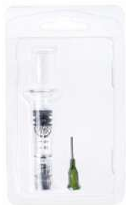
Clamshell Blister Packaging